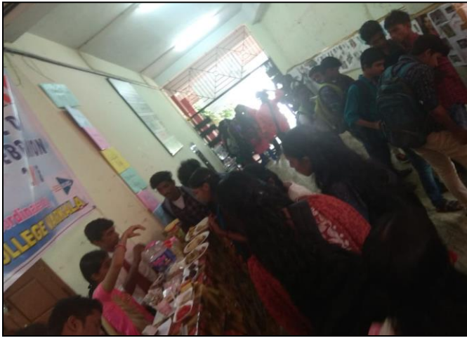
Participation of our students in collage...