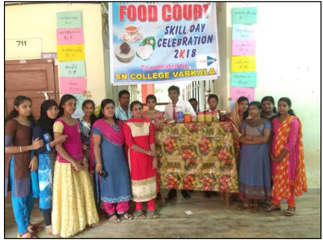
Food Court by our students...