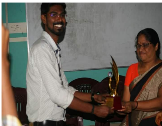
A small token of appreciation to SDE