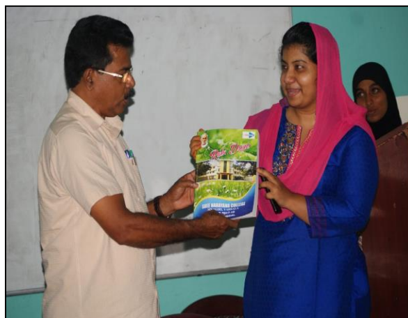
Magazine release by principal and PM