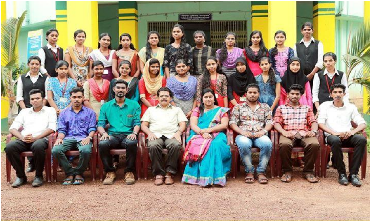
S.N College, Sivagiri, Varkala ASAP Batch 2017-18